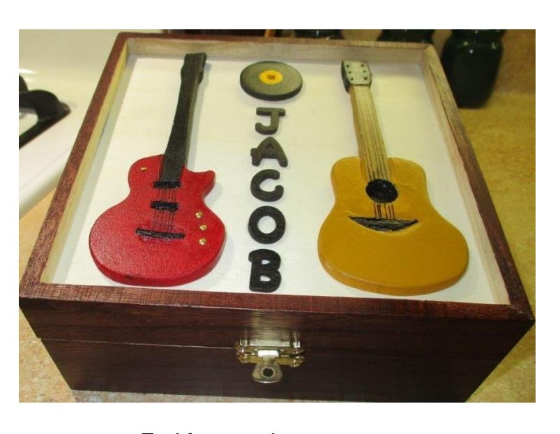
Earl for grandson