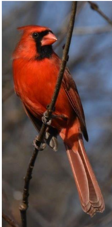
Northern Cardinal Aimee Nothnagle

Remember you can showcase your carvings by sending them to Susie to include in the next newsletter.