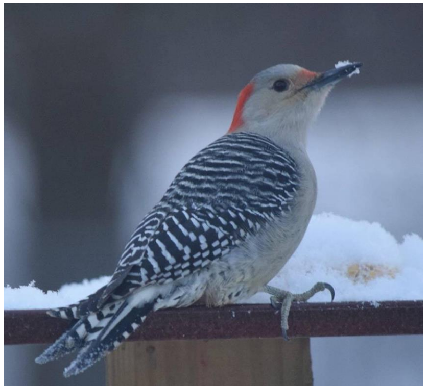
Red Bellied Woodpecker